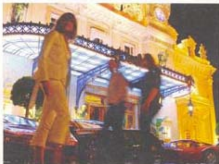
The Casino of Monte Carlo, designed by Charles Garnier of Paris Opera House fame, exudes 007 glam thanks to roles in two James Bond films.

WHERE TO STAY Low-budget hotels and B&Bs don't exist in Monaco, and many people opt to overnight more cheaply in nearby Beausoleil or Cap d'Ail, but guests need not sacrifice college tuition to spend a night in town. A Michelin-starred restaurant, harbor views, and a 20,000-bottle wine cellar cobbled into the cliff wall make the Port Palace (from $289) a popular pillow in Monte Carlo. The Columbus Hotel (from $190) in Fontvieille sits adjacent to the Princess Grace Rose Garden and has a swimming pool and complimentary shuttle service to downtown. The hotel's signature cocktail, "Grace," is a blend of candied rose petals, champagne, and rose liqueur. Hotel Miramar's 11 rooms (from $154) have a view of the Prince's Palace and yacht harbor. The hotel's rooftop bar is an excellent perch during May's Formula 1 Grand Prix, when cars scream by within feet of the hotel. ■