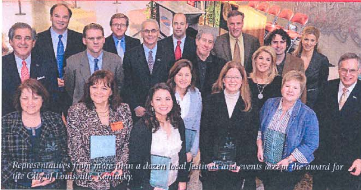
Representatives from more than a dozen local festivals and events accept the award for the City of Louisville, Kentucky.

Top North American City for Population Category: Over 1 Million