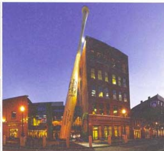
Pioneering: Louisville makes soy sauce, baseball bats, and Maya-inspired fare.